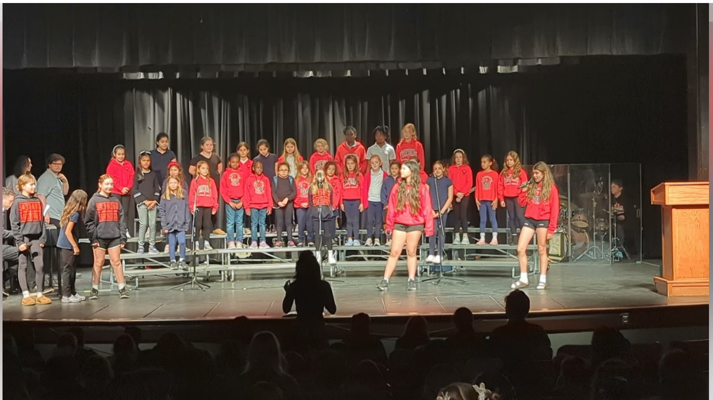
Celebrating Arts 2025